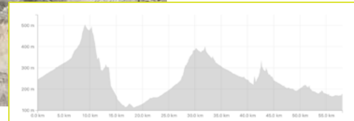
ROUTE ELEVATION PROFILE